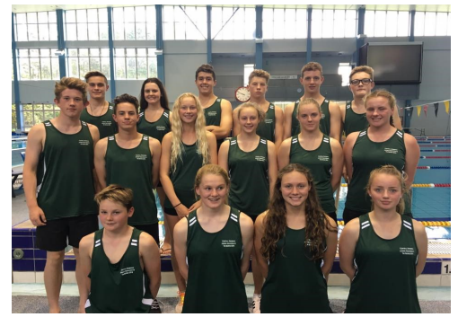
Tri-Series , Green Team