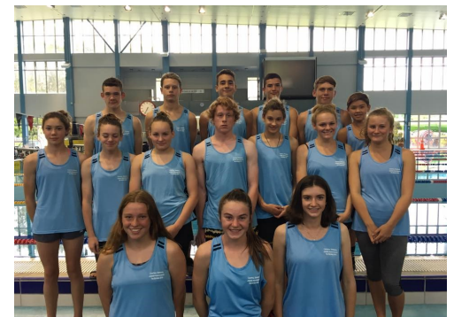
Tri-Series, Blue Team