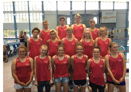
Tri-Series, Red Team